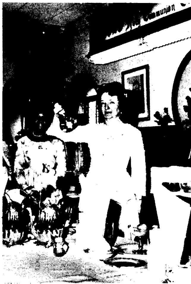
MOTHER DIVINE rings the bell at the Unity Mission Church on April 29 to begin the celebration of the Marriage Feast of the Lamb.

Praise and appreciation were the gifts brought to FATHER and MOTHER DIVINE by devoted Followers on Their 30th Wedding Anniversary, celebrated in numerous observances of the Marriage Feast of the Lamb in Philadelphia and at Peace Mission churches throughout the world on April 29.