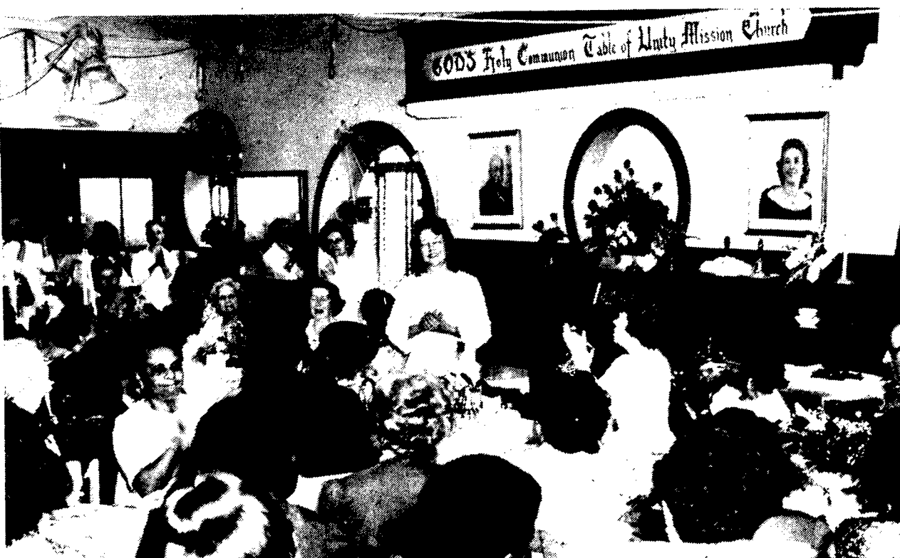
MOTHER speaking at the Unity Mission Church, April 29.

"FATHER searched the Heaven and HE searched the earth, Looking for Virtue, to give us a brand