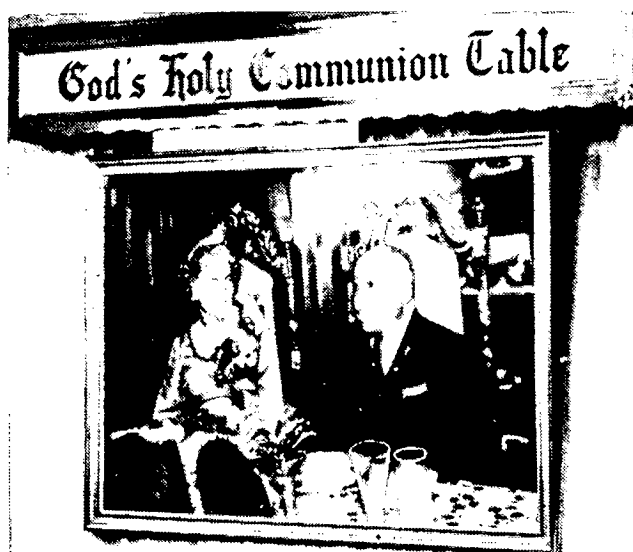
FATHER and MOTHER DIVINE's portrait graces the wall at the head of Holy Communion Banquet Table in the Church edifice on Central Avenue.