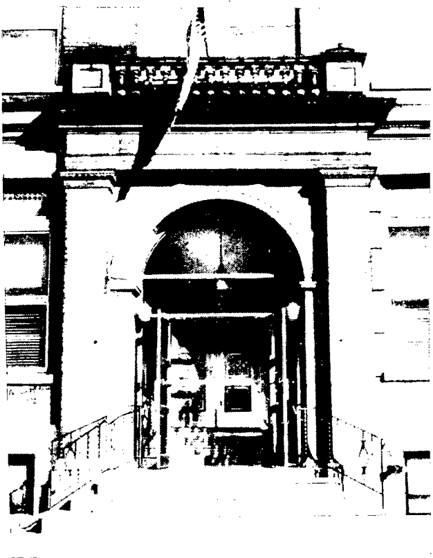
An inviting entranceway to the Church

A large Assembly of Officers, Trustees, members and Followers were present, including representatives from some of the other incorporated Churches under the Peace Mission Movement — all awaiting the official opening of the Meeting