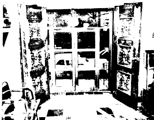
View from the interior at the Church entrance.

Now we thank YOU, FATHER, for YOUR Personal Presence with us this evening. It is al-