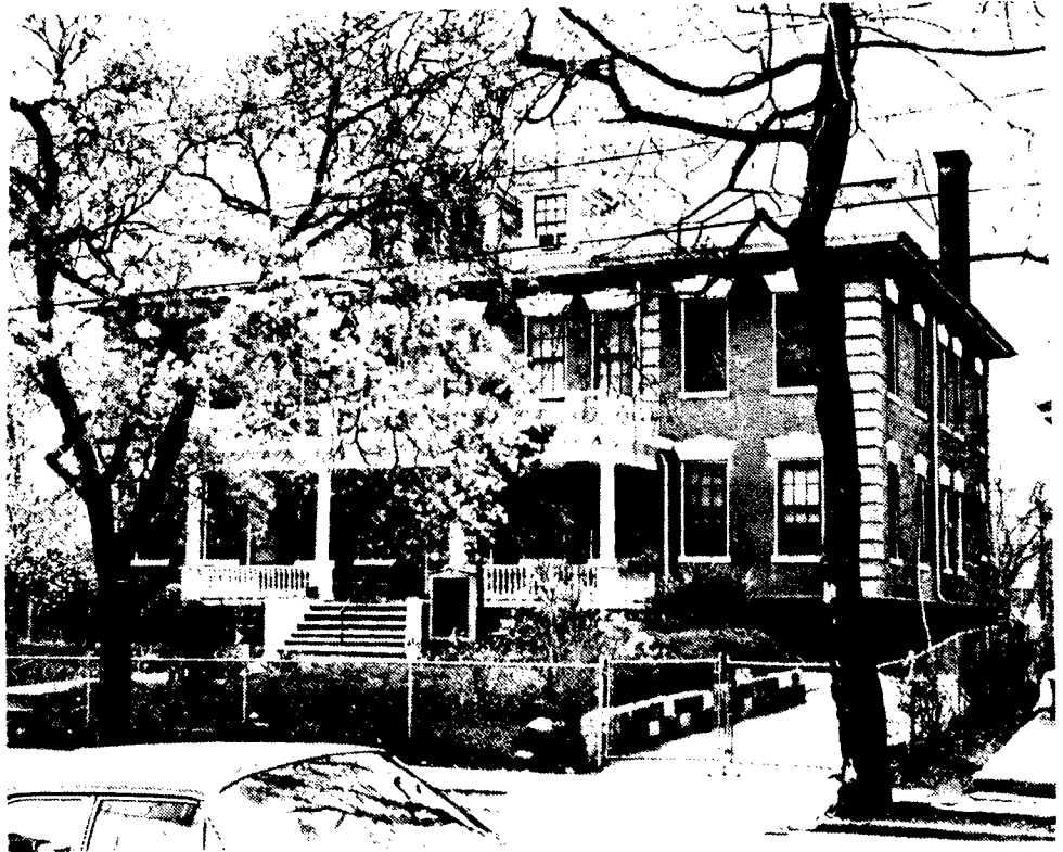
Church property at 22 Halleck Street in North Newark provides a comfortable Church home and chapel for the members.

So may we again thank YOU and MOTHER DIVINE for being Personally Present with us this evening, and may we ask YOU to forever be with each one of us here and throughout our wonderfully blest city. May it prove itself to be a beacon light out here on the shores of the Atlantic ocean. With YOUR and MOTHER's Blessings, may our visiting guests by the way of the Bicentennial, see the Light, giving all Glory and all Honor to GOD, in Whom all must trust, and may we on the earth have peace, joy and pros-